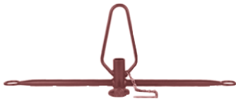
Type 500305 Trapeze