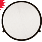
Type 24549 Safety Screen