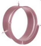
Type 24515 Diffuser Holder