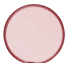
Type 450763S Single Moledura Scrim