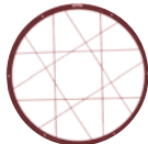
Type 450481A Moledisk Diffuser Frame