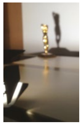
FRESNEL SINGLE SHADOW PROJECTION