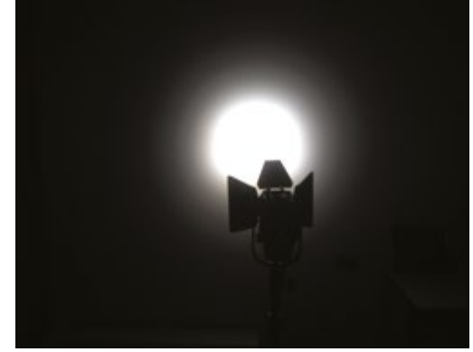
PICCOLETTO IN FULL SPOT INTENSE AND FOCUSED BEAM (BEAM ANGLE =18°)