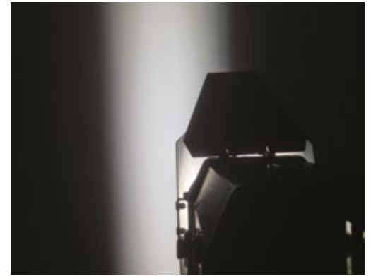
NARROW SETTING OF BARNDOOR